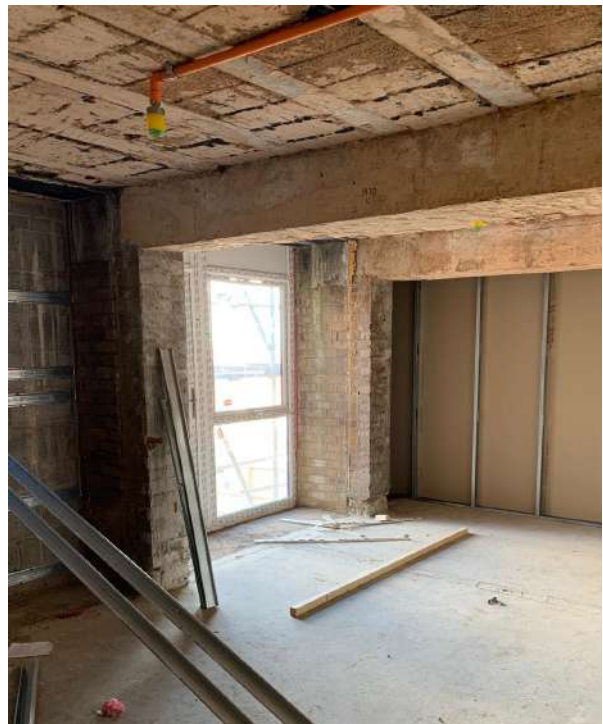
Installation of windows near completion and completed the installation of the 1st fix for the sprinklers.