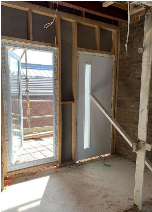
Installation of doors.