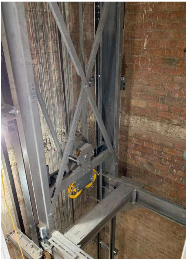
Commenced the installation of the lift.