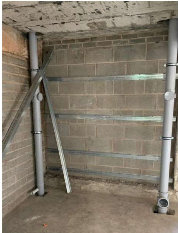
Completed the installation of the soil vent pipes.