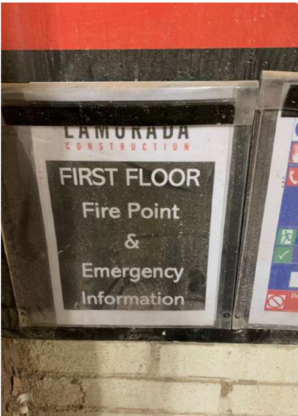
Temporary fire strategy in place.