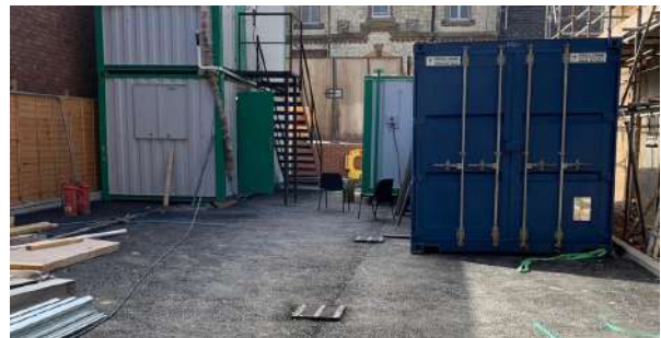
Prepared and applied tarmac to the rear car park.