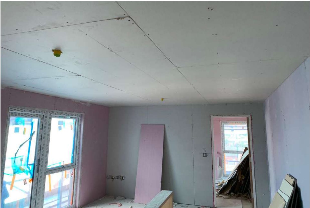
Installation of fireproof plasterboard.