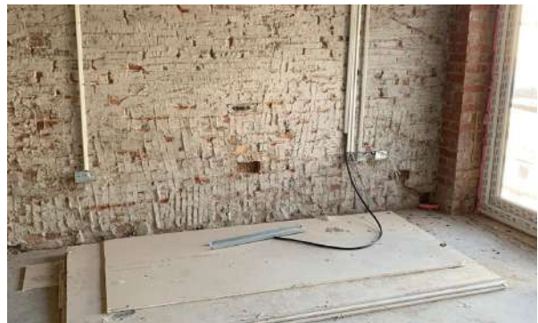
1st fix electrical