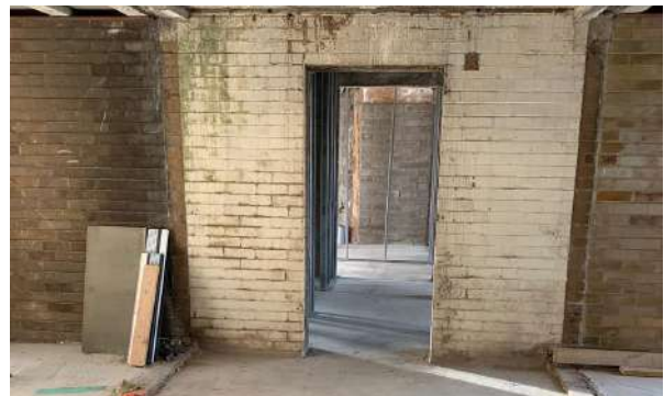
Completed the new retaining wall.