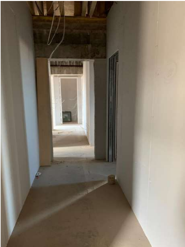
3rd floor CP corridor boarding out completed.