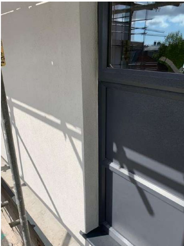
Commenced the installation of the insulation and render to the 3rd floor.